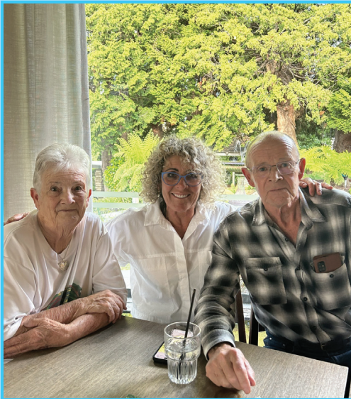
Carers Cascade festive function