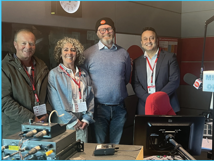
ABC studios – Giving Tree Appeal