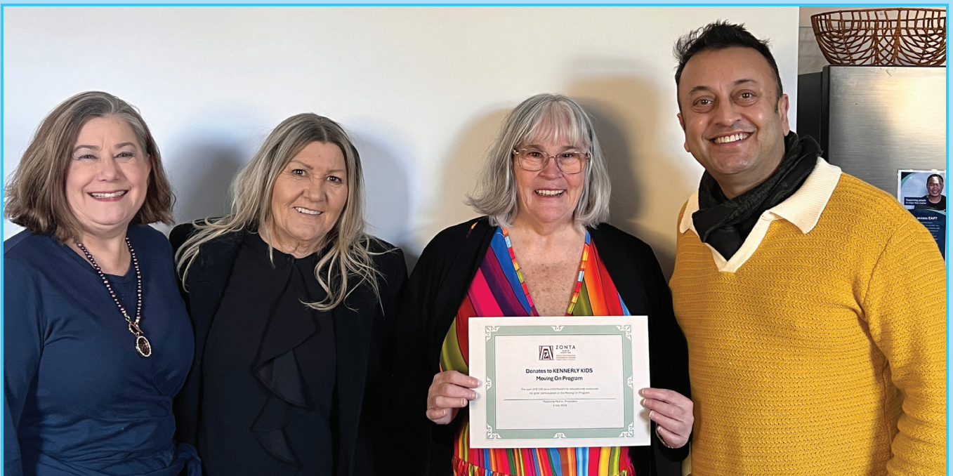
Donations from Zonta Hobart