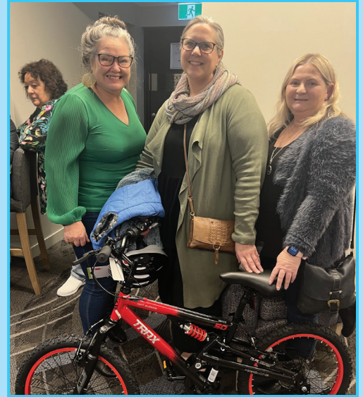
Bike donations from XLEvents